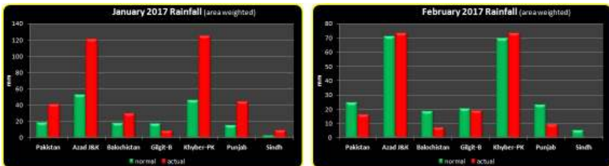
Fig-3: Country & provinces rainfall distribution (January & February 2017)