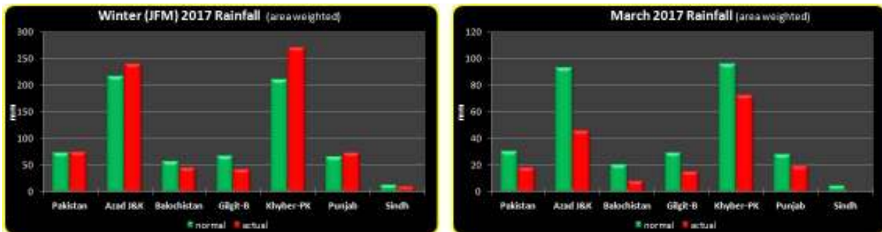
Fig-2: Country & provinces rainfall distribution (Winter & March 2017)